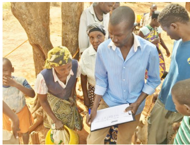
Community rabies vaccination campaign