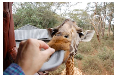
Meeting the orphans at the Sheldrick orphanage in Nairobi Feeding the tall ones at the Giraffe Center

Ol Donyo Sapuk Resort, in the shadows of Mount Kilimambogo