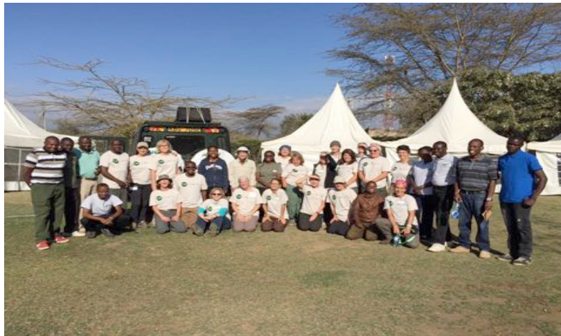
The whole 2016 Vet Treks and ANAW Crew in front of clinic tents Can we beat the record of 104 sterilization surgeries? Yes! Yes, we can – with YOUR help!