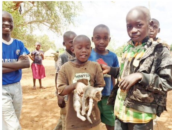
Children bring their pets for vaccination – cats are very popular!

We vaccinated 3000 dogs and cats and 600 donkeys in 2016!